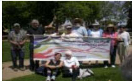
Memorial Day Silent March