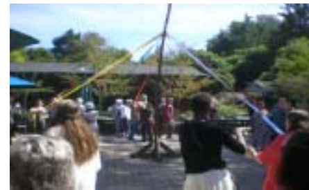
Dancing around the Maypole!

Please submit all Unicorn newsletter related materials to unicorn@uufsc.org The due date for the September issue is August 8: please note the early date.