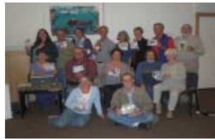
Coordinating Council Meeting