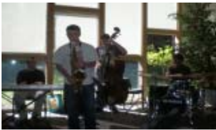
Jazz band “Signals” played for us.