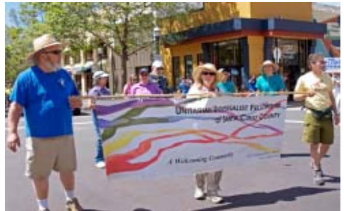
UUF members march in the 2010 Gay Pride Parade