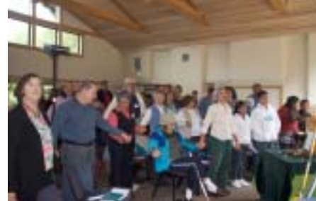
“From all that dwells below the sky”