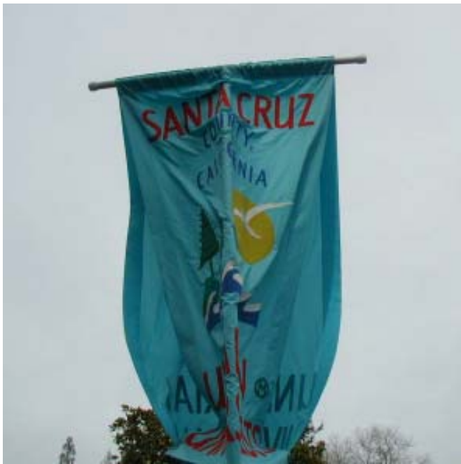
The Fellowship banner flies high at the peace march in Santa Cruz.