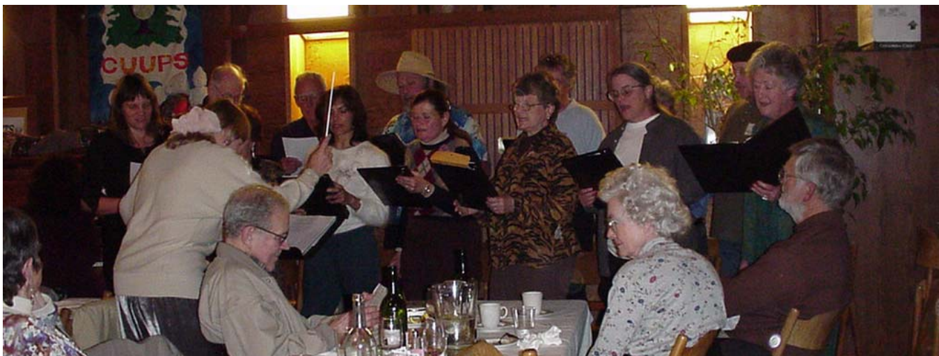
Members enjoying the choir perform at the Congregational Dinner

Remember: This sale is an important part of our 2004 budget.