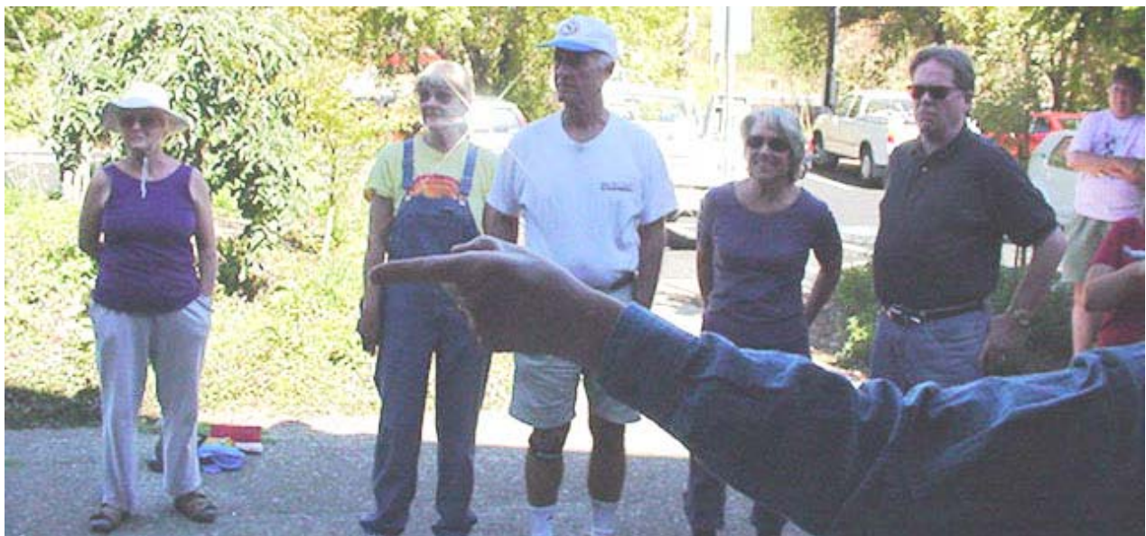
"Labor of Love" volunteers getting instructions on where to go and what to do.

[462-4995 or terracollieryoung@yahoo.com]