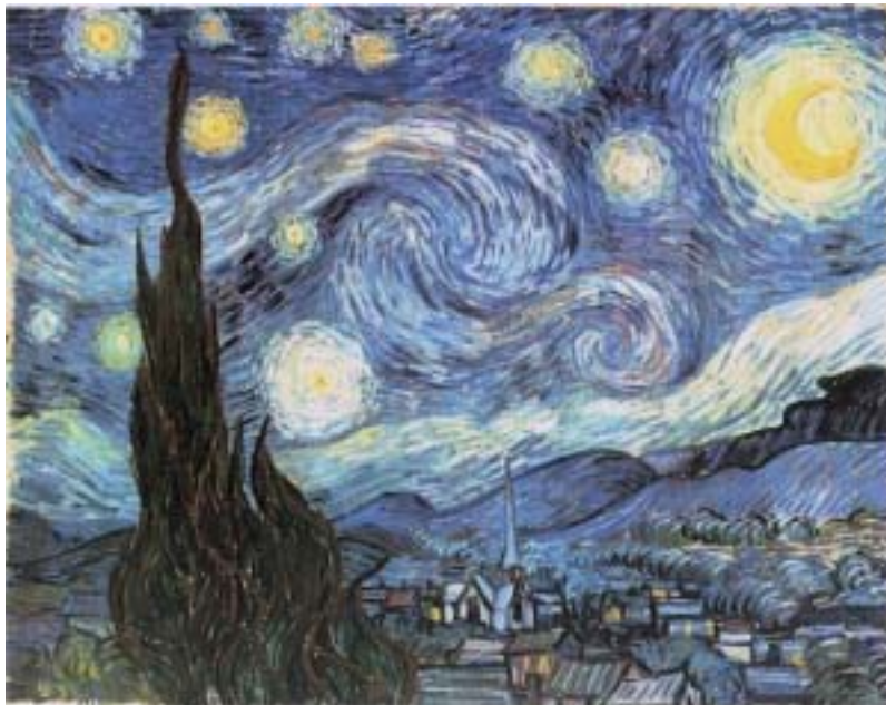
"Starry Night" Vicent Van Gogh (1889)

The UUFSCC is an equal opportunity employer. Qualified UUFSCC members are encouraged to apply recognizing that they will be evaluated using the same criteria as all applicants.