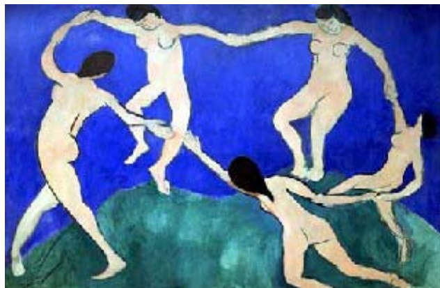
Henri Matisse's "The Dance" (1910)