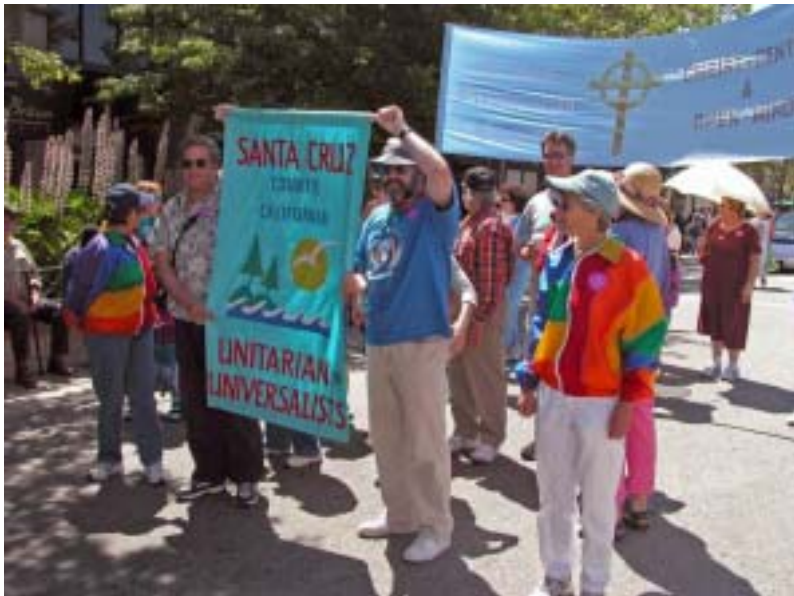
Above: UU's at the Gay Pride Parade

Also: Erica Crawford is pleased to announce: http://homepage.mac.com/ericacrawford/PhotoAlbum1.html