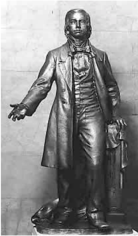
Thomas Starr King, "the orator who saved the nation."