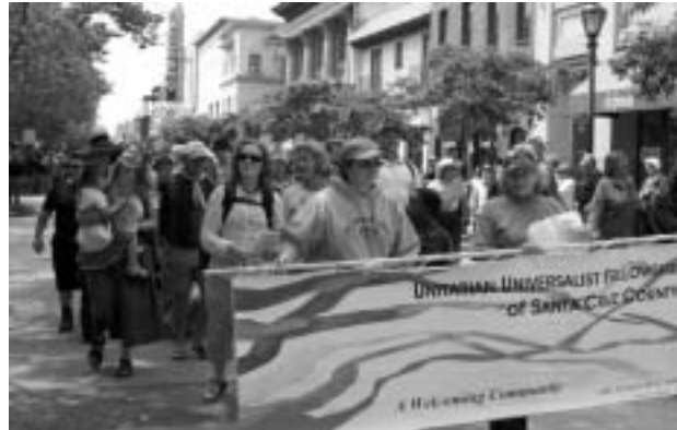
Santa Cruz Pride Parade, 2007 “We are gay and straight together, and we are singing, singing for our lives!”