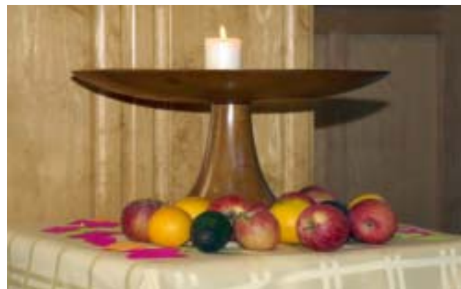
Our Chalice